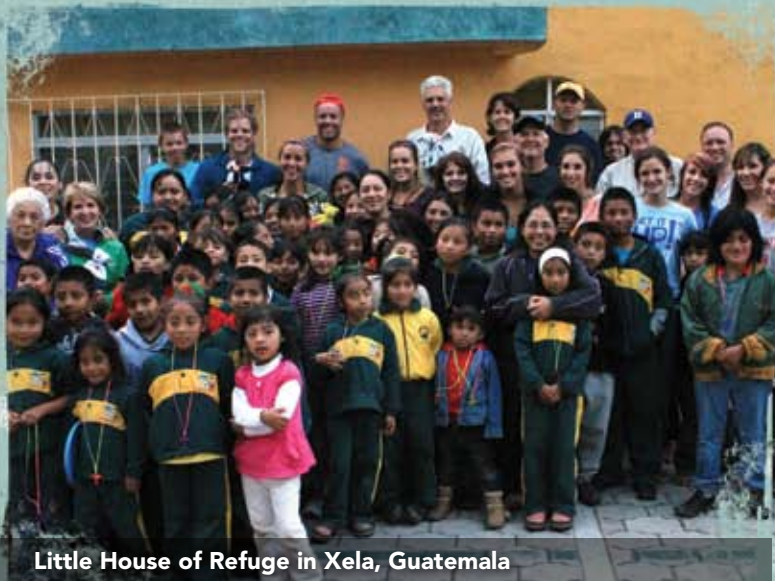
Little House of Refuge in Xela, Guatemala