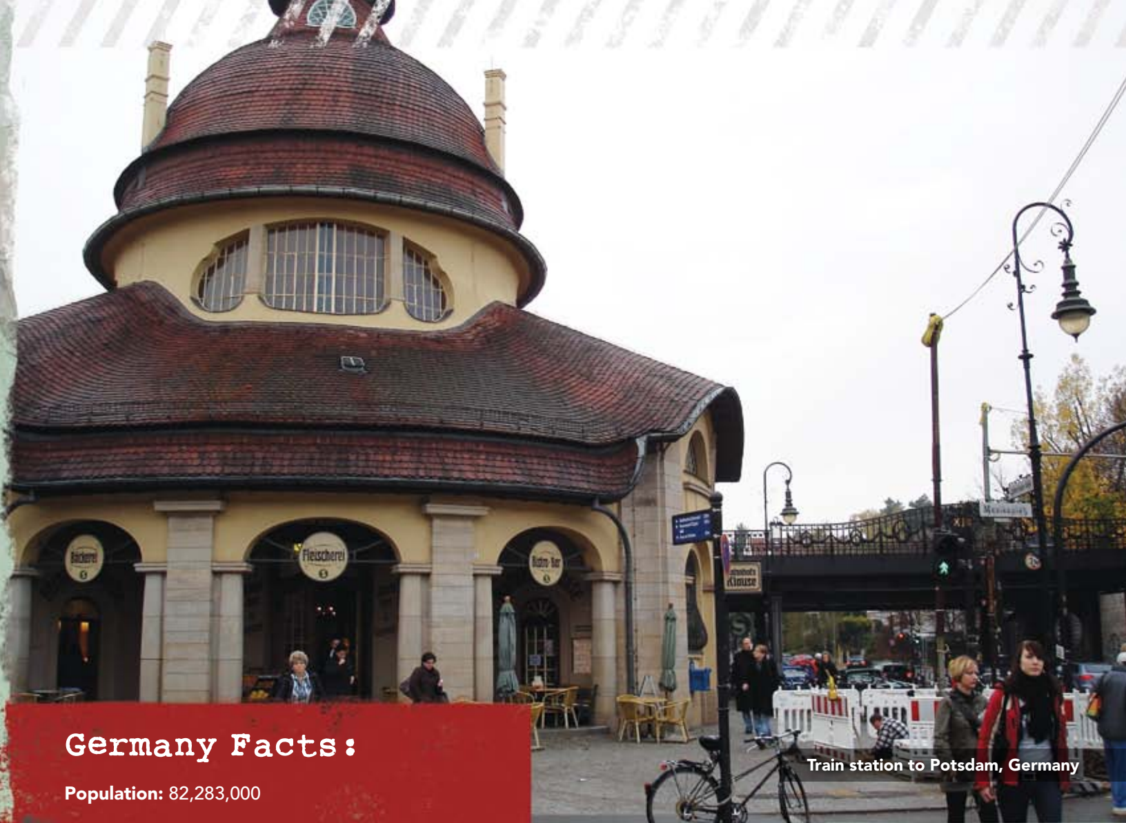
Train station to Potsdam, Germany