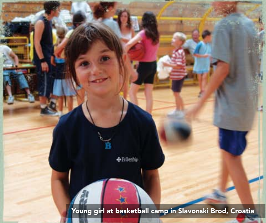
Young girl at basketball camp in Slavonski Brod, Croatia