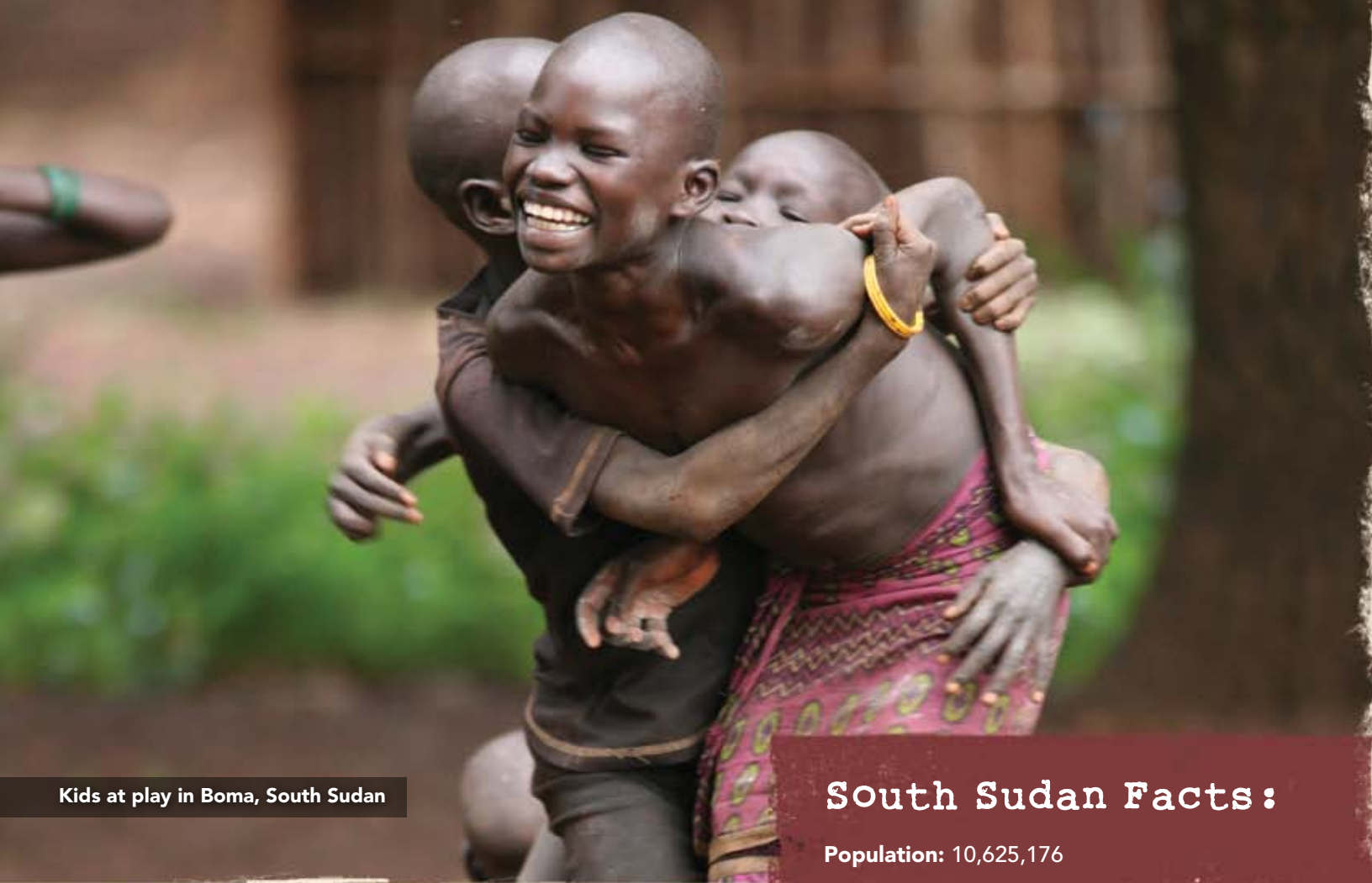
Kids at play in Boma, South Sudan