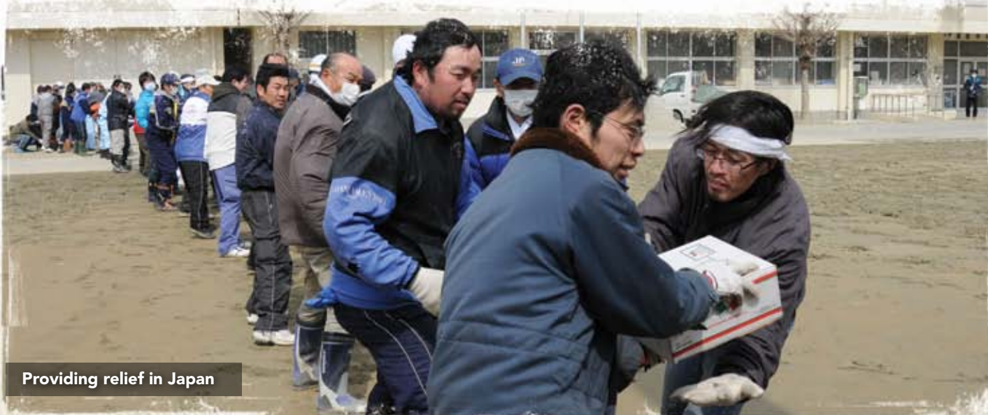
Providing relief in Japan