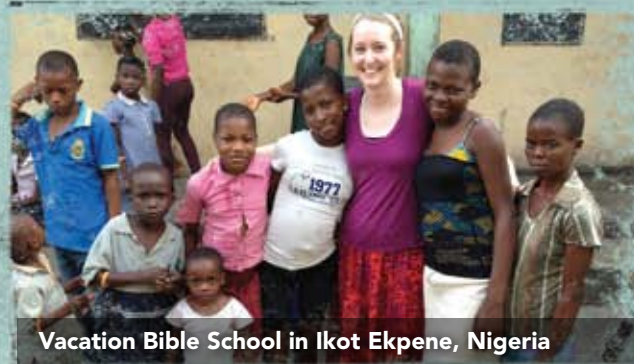
Vacation Bible School in Ikot Ekpene, Nigeria

Worked with Fellowship Bible Church, Nigeria to host a community-wide VBS in Ikot Ekpene, Nigeria.