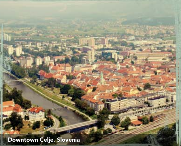
Downtown Celje, Slovenia