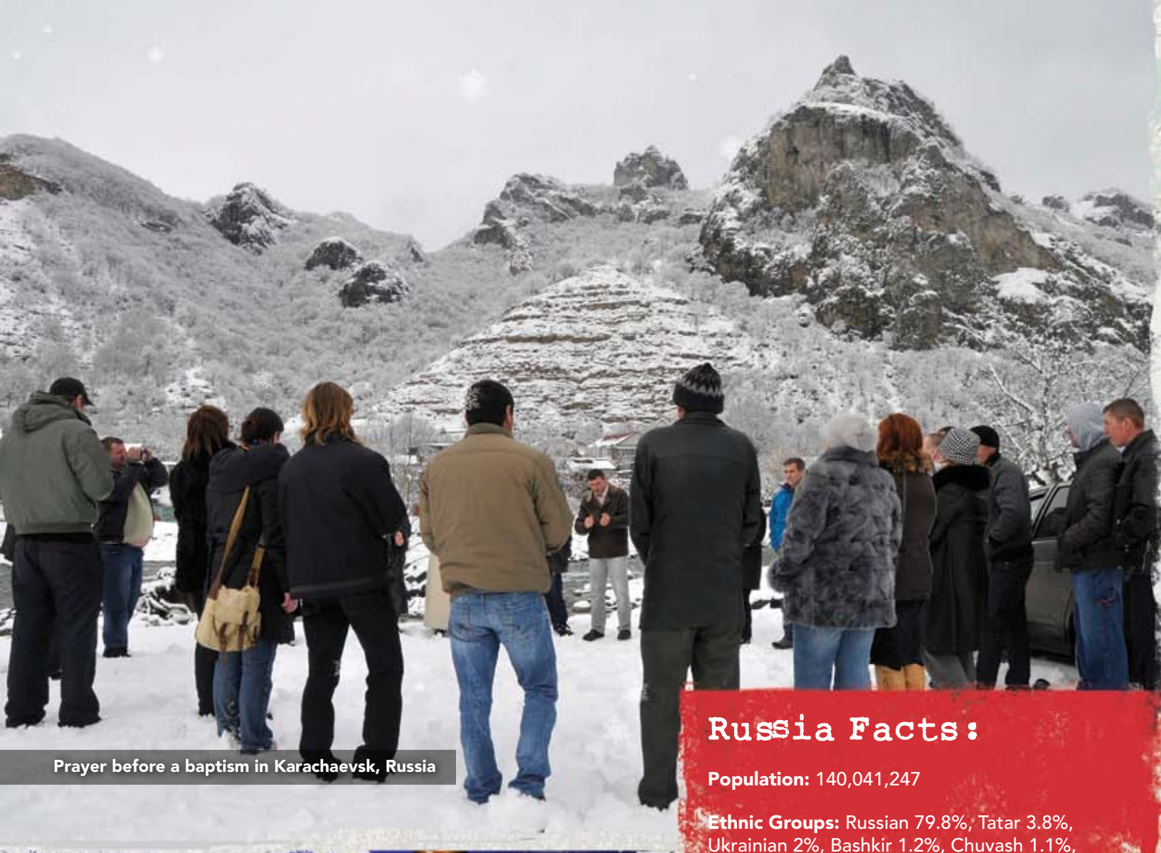
Prayer before a baptism in Karachaevsk, Russia