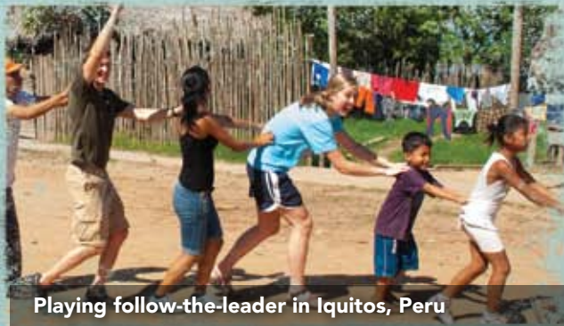
Playing follow-the-leader in Iquitos, Peru

We distributed last year's Global Offering resources to support the mission of our strategic partnerships and we sent our people to help them carry out their mission.