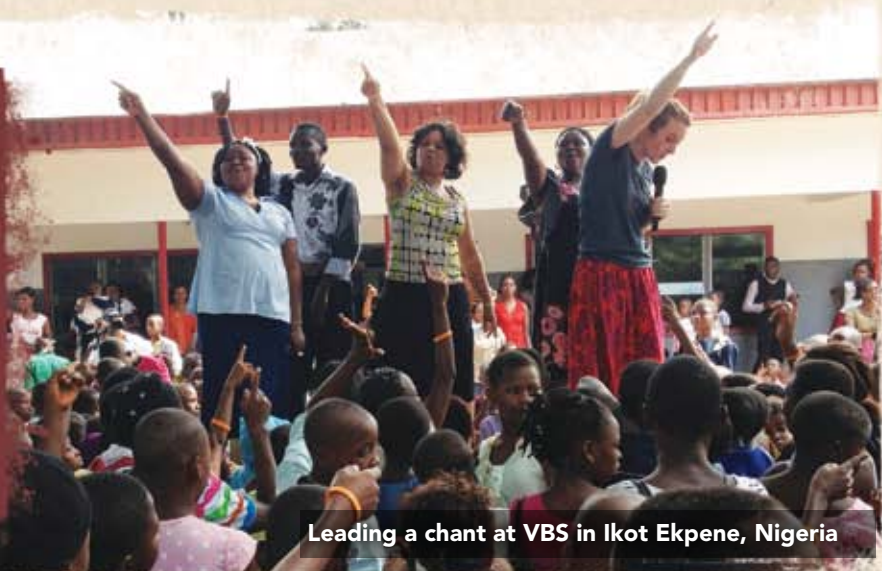
Leading a chant at VBS in Ikot Ekpene, Nigeria

Religions: Muslim 50%, Christian 40%, Indigenous 10%