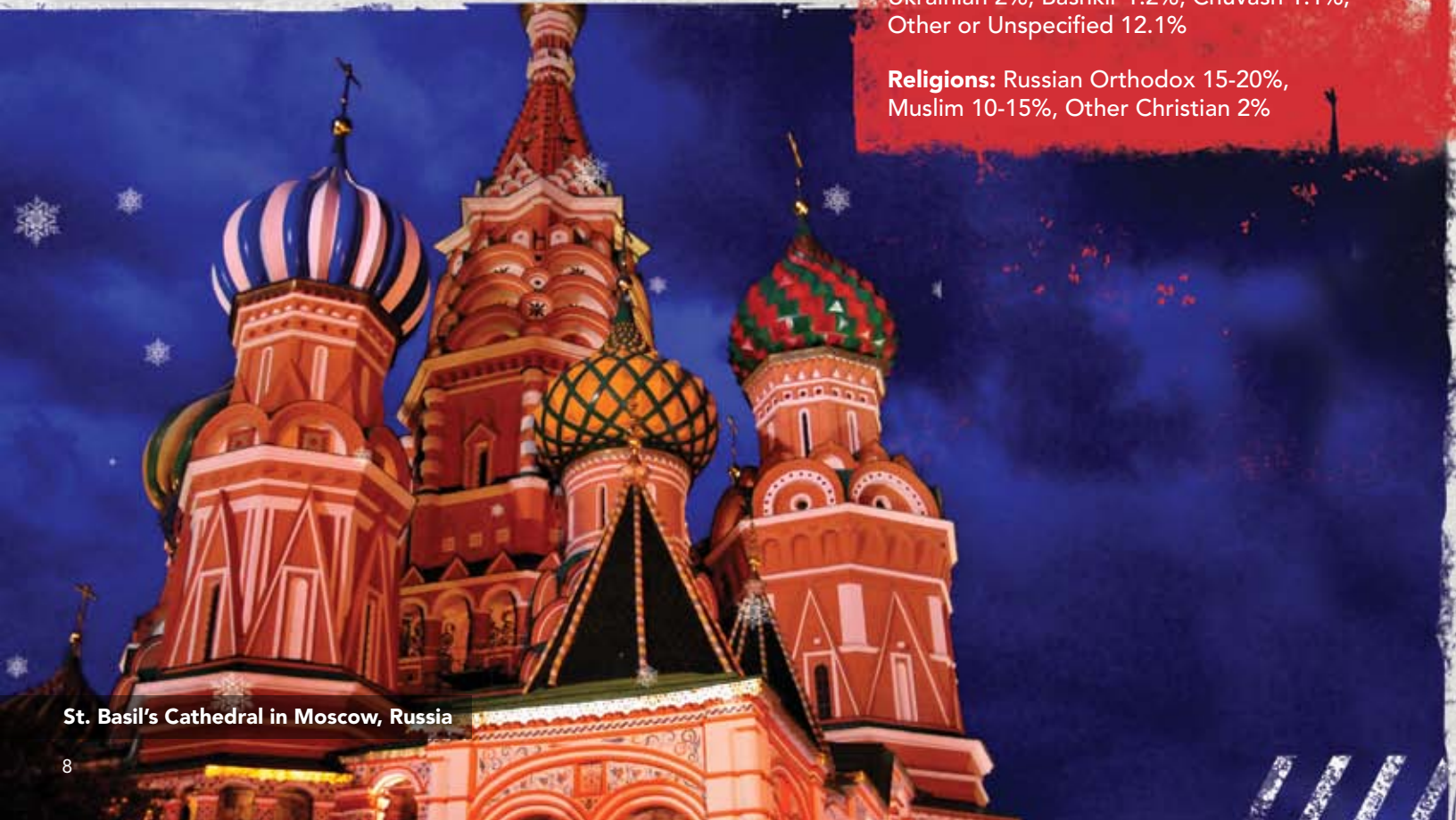
St. Basil's Cathedral in Moscow, Russia

Religions: Russian Orthodox 15-20%, Muslim 10-15%, Other Christian 2%