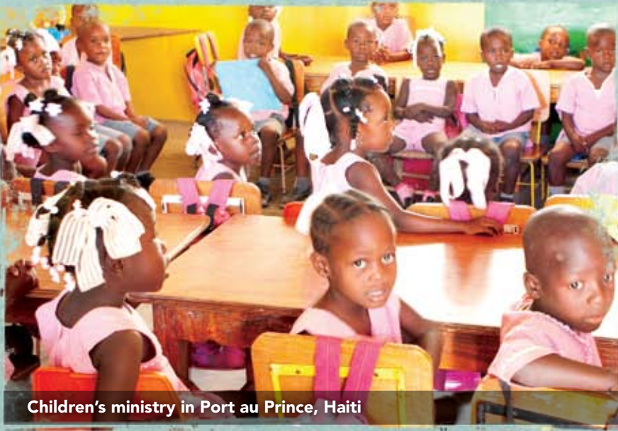
Children's ministry in Port au Prince, Haiti